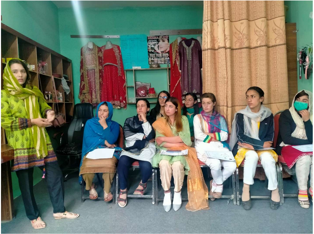
Training Participant with full interest hearing the lecture of master trainer