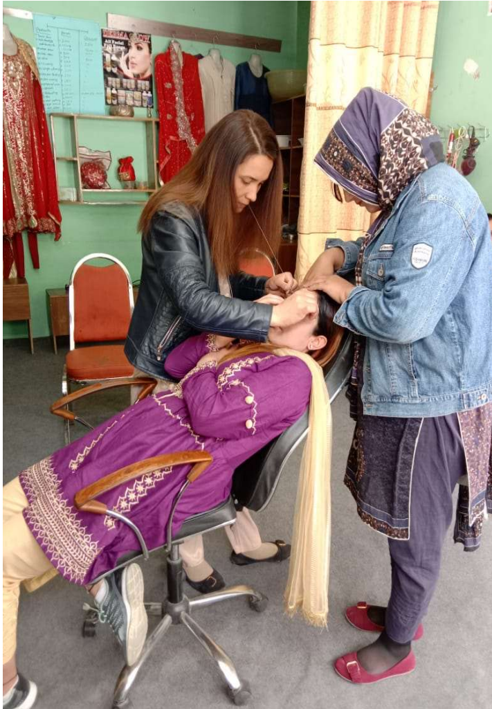
Master trainer training students, how to thread and shape eyebrows